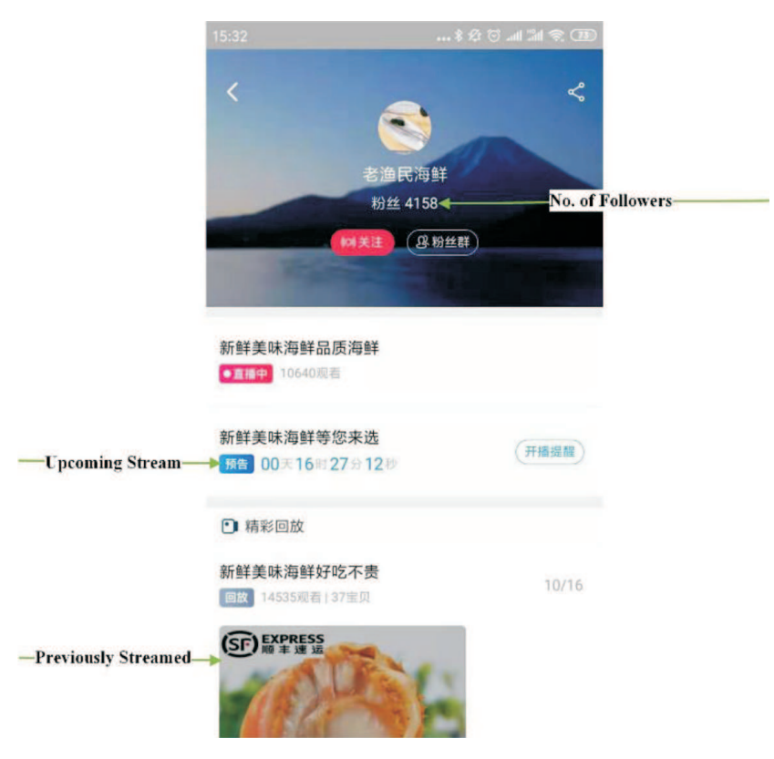
Figure 3: Stream-Record Interface.

an order. To validate our findings and for generalization, we further collected data from a similar B2C/C2C LS platform known as JingDong (JD) with the same time frame (prime time) following all the rules applied to the initial data gathered from Taobao LS platform. JingDong is the third largest B2C/C2C Internet Company worldwide and the leading B2C/C2C online retailer in China (see Globe Newswire [15], and Ji-Yue [24]).