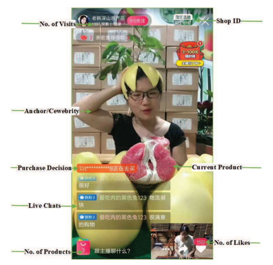
Figure 2: Customer Interactive Interface.

We gathered a total of 498 datasets from Taobao (273) and JD (225) mobile LS platforms. Data were collected between the hours of 20:00 to 22:00 (+8GMT) noted as the prime time in January, April, and July covering Winter, Spring, and Summer. Taobao and JD are few adopters of LS for product experience that adopted LS. It is on record that more than 150 thousand live-broadcasters stream-live on Taobao (see iiMedia Research Group [22]). Half of the viewers are also said to be post-90s borns. An indication of the involvement of a youthful generation in green and sustainable lifestyles. The live broadcast industry is mainly maternal and child, beauty, food, sports, and fitness. More than 1,000 cewebrities have used Taobao LS to broadcast live shows and do e-commerce. Each night from 20:00 to 22:00 (primetime), is not only the most active time to watch the live broadcast but also the time when users are most willing to place